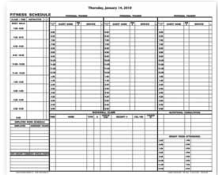
Custom Fitness & Spa Schedule, 12x09

for more — or less — detail in scheduling their activities. So if you don't see a pre-designed book that is right for you, let us custom design a book just the way you want it. If your property has more function rooms, more frequent table turnover, different course or court activity or different information to be captured, you need to customize to achieve maximum efficiency.