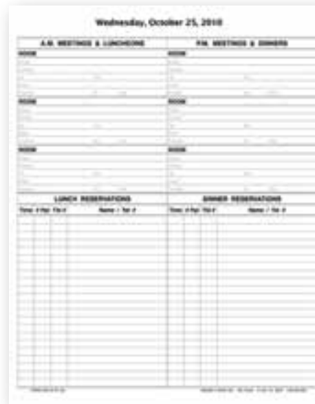
Pre-Designed Combined Form, 12x9

Forms for all our bindings, and to serve as a beginning template for further and more complex changes and specifications. The form to the left is our 12 x 9 pre-designed page for Table and Function books. The form on the next page is an example of a customized page, with descriptions of the kinds of changes we produce.