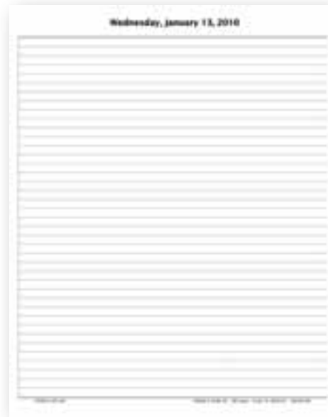
Pre-Designed Plain Line Form, 12x09

Design for Maximum Efficiency With our years of experience and available design tools, the process of making a custom book is a streamlined process at suprisingly little additional cost. Many properties have a preference